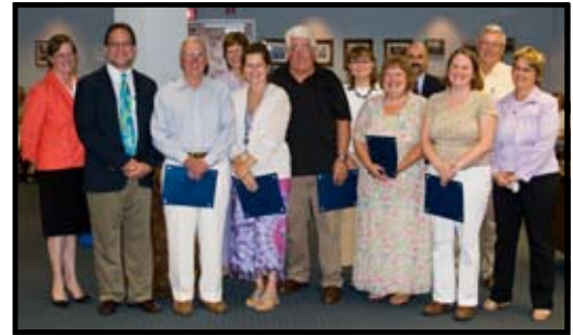
Seneca County Department of Human Services Administration and VITA Volunteers

United Way is working to address our communities' housing challenges, expanding access to literacy training and food programs through greater collaboration, and a team of dedicated volunteers provides free tax assistance to eligible residents.