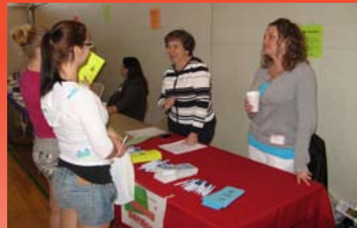
Representatives from Human Services talk to youth at the Career Fair.